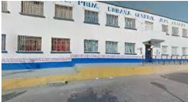
School Juan Aldama Tezontepec de Aldama