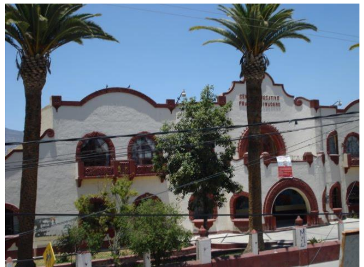
School Francisco I. Madero Town Francisco I. Madero