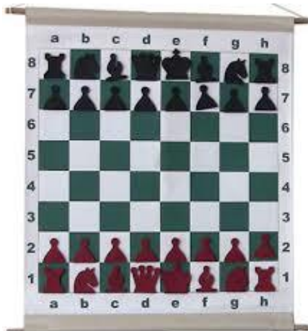
Demostration Chess Set