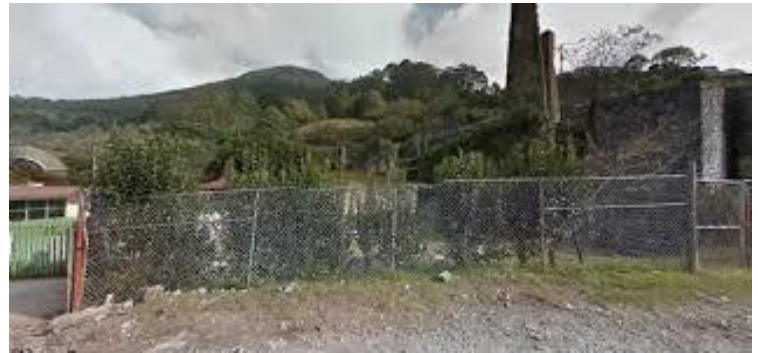
School 227 Zimapán